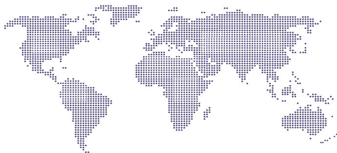
Kratos' SDA services are powered by a world-wide network of 20+ sites and 140+ sensors

This unique global commercial deployment of hundreds of antennas gives Kratos unparalleled access to satellite signals.